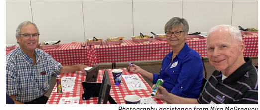
Photography assistance from Mira McGreevey