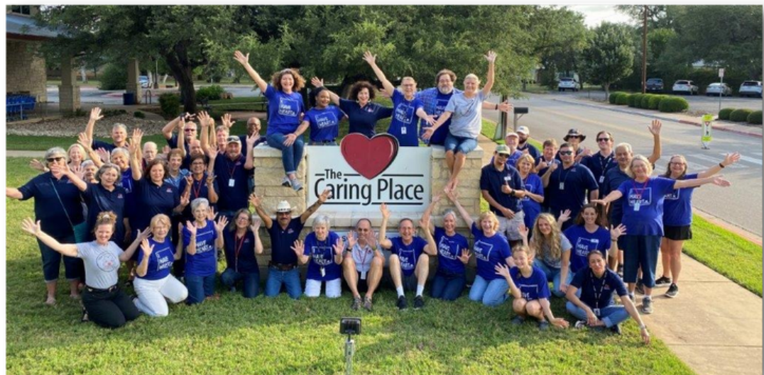
Imagine your face in this group of friendly staff and volunteers in the next year!

Learn more at caringplacetx.org/volunteer .