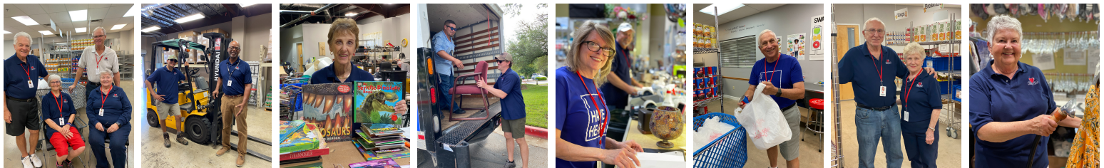
These Volunteers and Staff participated in our annual "Spirit Week." We love when our team wears their TCP shirts! In these pictures you can see some of our volunteer opportunities in action.

Visit caringplacetx.org/volunteer to learn more or to fill out an application.