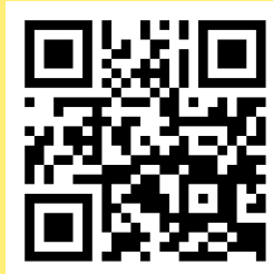
Scan to learn about services.